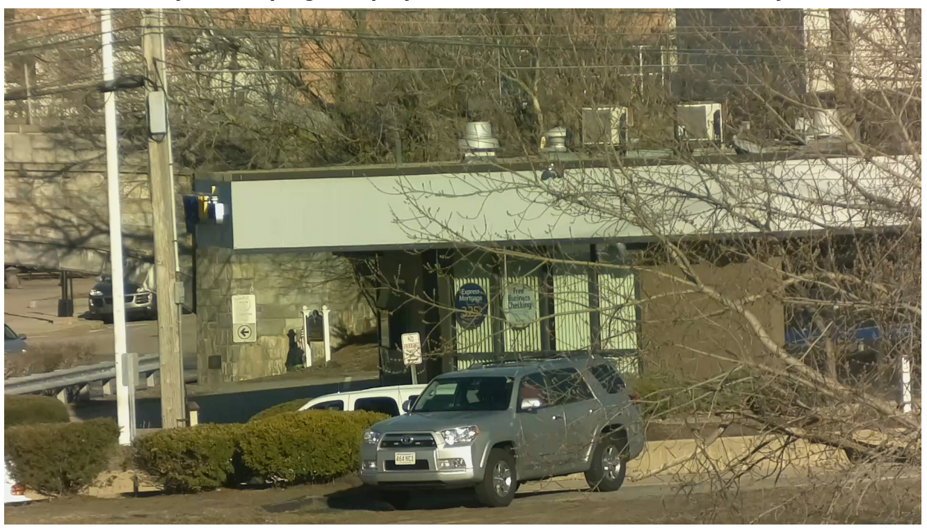
Vehicle license plate can be read at a distance of approx. 150 yards in daylight at max. zoom

Small, inconspicuous, low power, ultra low bandwidth, high definition, custom-preconfigured, covert cellular system is plug-and-play and intended for use at 50 to 150 yards.