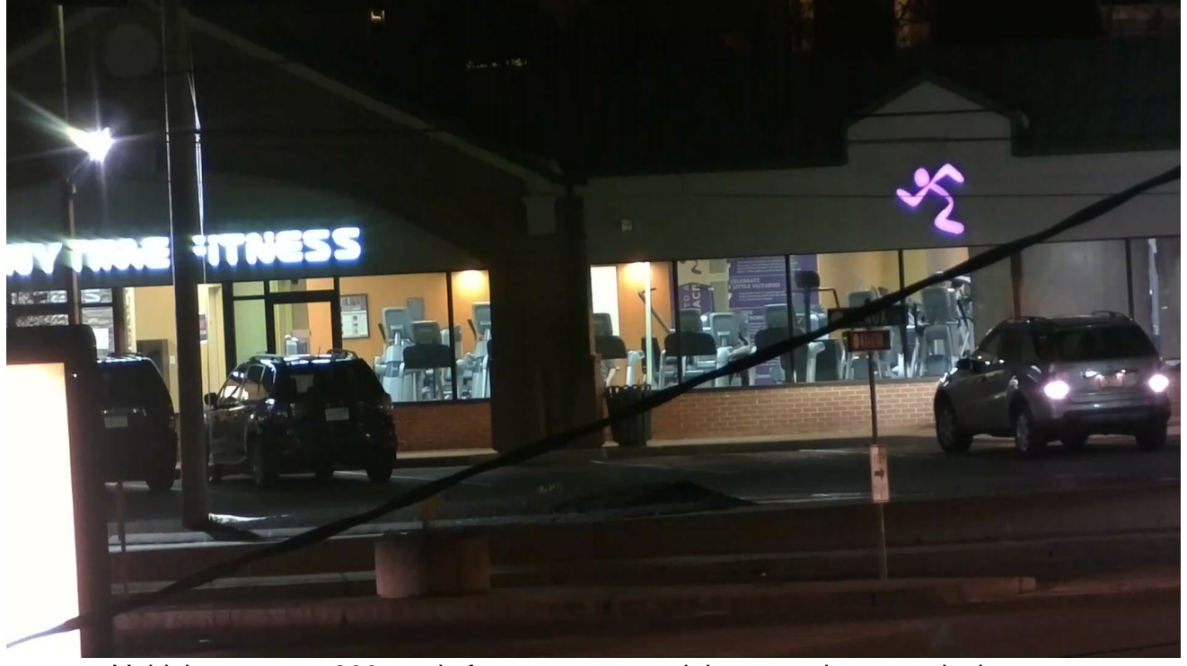
Vehicles approx. 200 yards from camera at night at maximum optical zoom